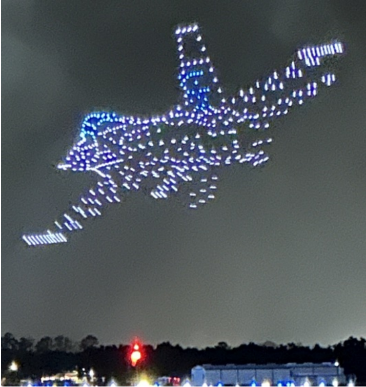
Spectacular Drone Show

The night airshow is always a crowd favorite. There are two identical night shows on Wednesday and Saturday. There are FA-18s made of drones, lasers, fireworks, fires, explosions and an airplane doing aerobatics in the middle of all of it. Something for everyone.