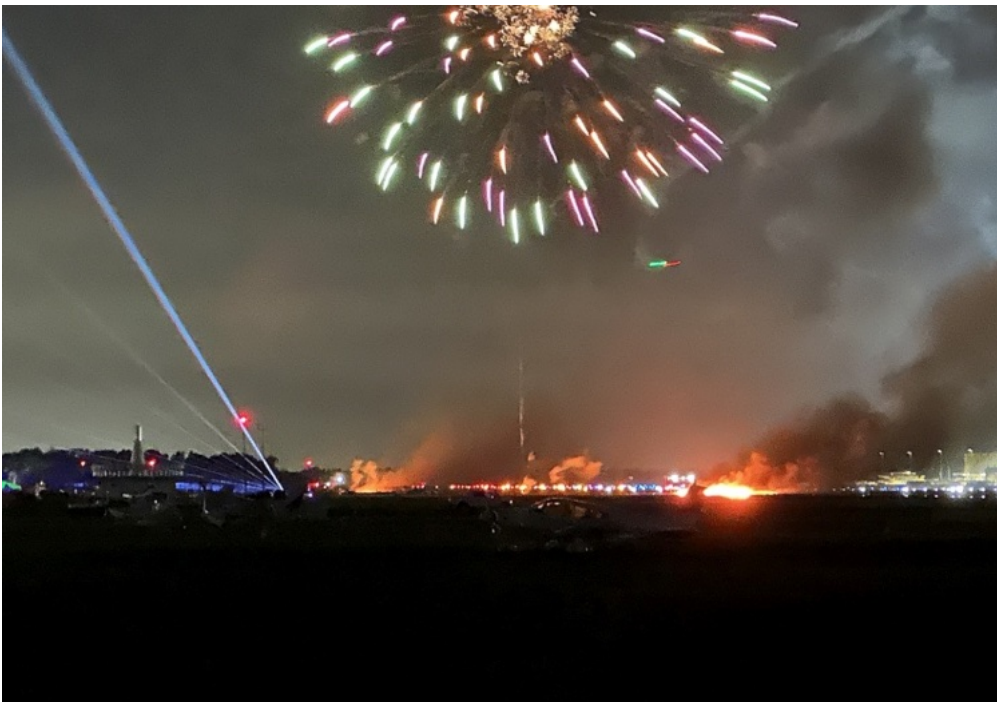
The Saturday Night Show

It was reported that there were no aircraft incidents at the event. The most serious thing I saw was a 172 with a flat nose tire on TWY D. Between our group, emergency aircraft repair and a new tire/tube from the exhibitors he was in a regular parking spot in two hours.