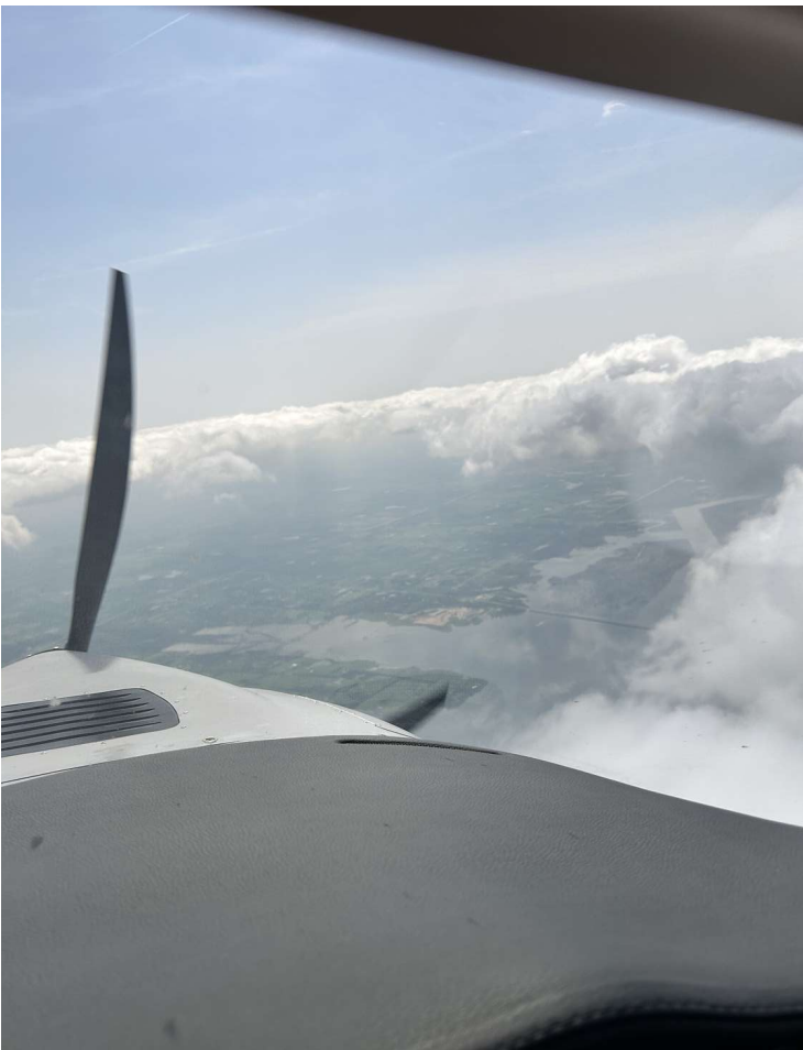
Clouds enroute to Cedar Mills

I have a few squawks I'm working thru. The first was a FPCM (fuel pump control module) fault for about 2 seconds then clears. It happens about 40% of the time when