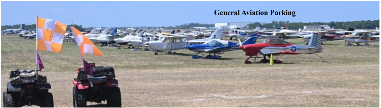
General Aviation Parking