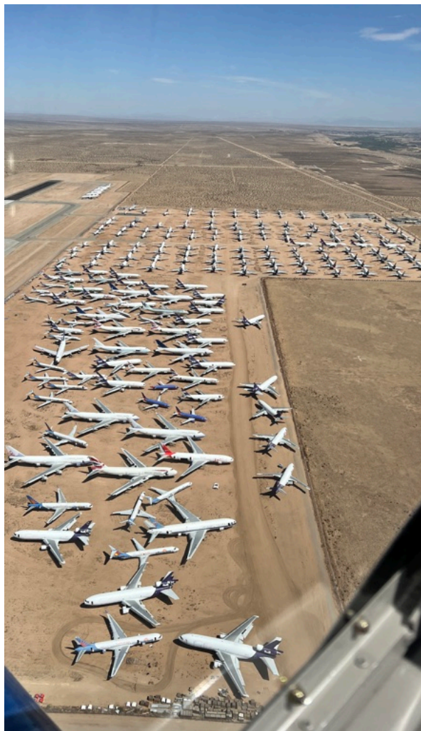
The Victorville Boneyard

One of our more interesting stops was Victorville, or the Southern California Logistics Airport. I knew this was the “boneyard” for airliners.