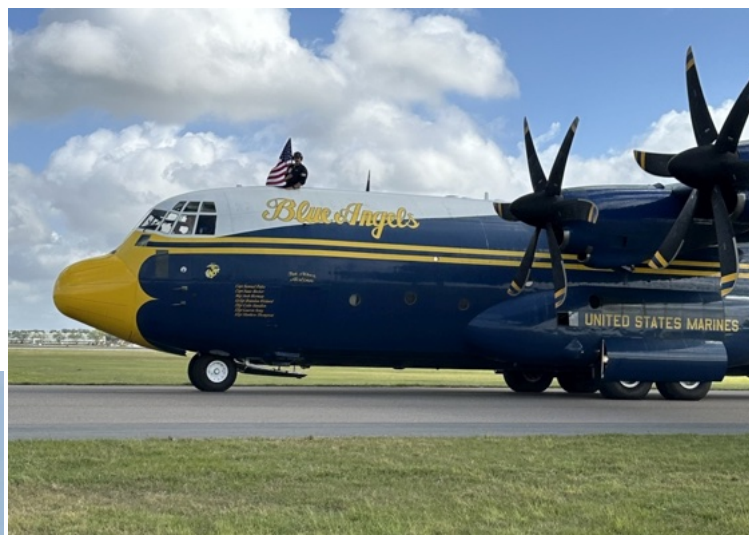
The Blue Angels support aircraft “Fat Albert” C-130.

One of the nice things about working on the taxiways is there are some interesting aircraft that occasionally taxi by.