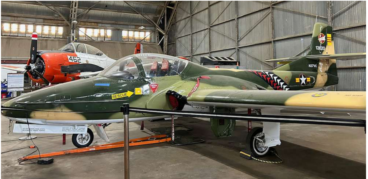
Cessna T37 Jet Trainer

and Cold War era; however, I don't know that I'd ever seen one before.