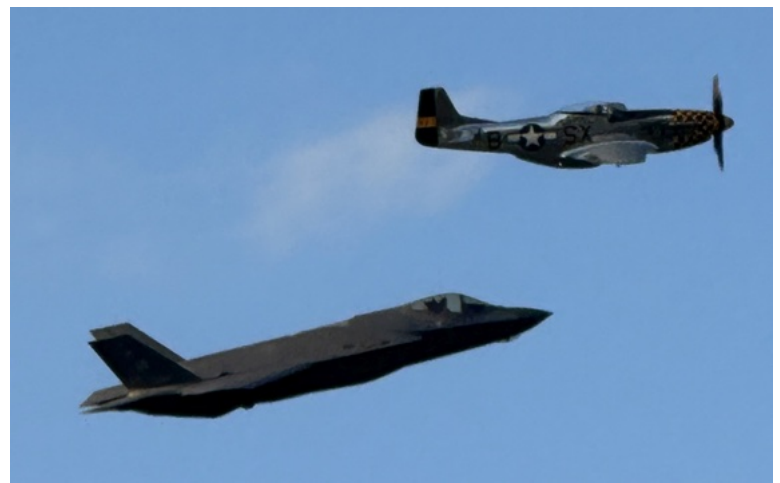
USAF Heritage Flight

The Heritage flights are one of my favorites. This year there were actually two, one Air Force and one Naval Aviation which coincided with the show by the Blue Angels.