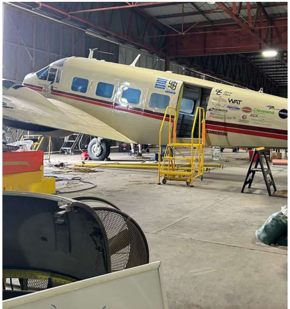
The Hollywood Bomber almost ready for Oshkosh

After the museum, the majority of the group headed to Cooper's BBQ for lunch. We shared stories, and I got to better know some of my fellow chapter members. Thank you to every one that made it out. Hope to see the rest of you next time.