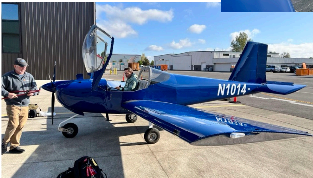
The new RV-12 and our chariot home

In southern California we flew within sight of Edwards AFB and Palmdale, which I didn't think we could do, but we were using flight flowing for the entire trip.