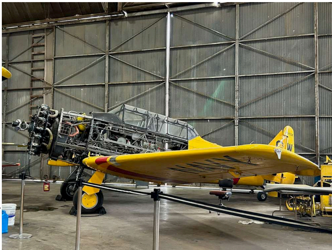
T-6 cutaway view

aluminum skin, a Texan is more similar in construction to a Stearman than other WWII era aircraft. The T-37 was a very interesting specimen too, and we spent quite a bit of time examining and discussing some of its unique aerodynamic design features. Nicknamed the "Tweety Bird" for the high pitch whistle of its under-powered twin turbine engines, it was a very prolific primary jet trainer through the Vietnam