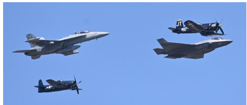
USN Heritage Flight