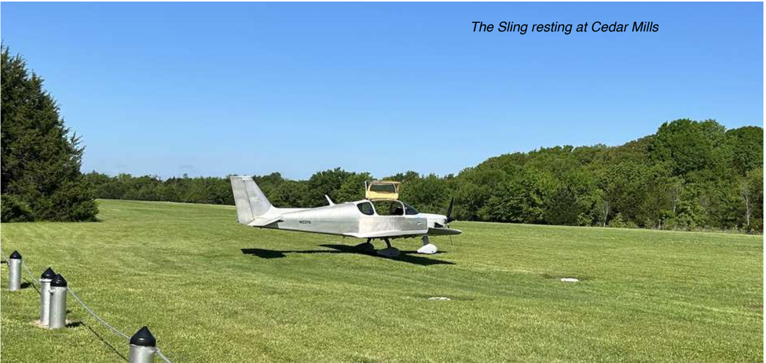
The Sling resting at Cedar Mills

factory said they would be. T/O is pretty quick, rotate about 55 right to 15 degrees to catch and maintain 75. With the turbo providing full power to 15,000 it just keeps climbing. Most of the testing was around 5,500 feet where I'm seeing 120-130 TAS on 7 gallons an hour. The plane is a lot more slippery than a 172 and it is an effort to get it slowed down.