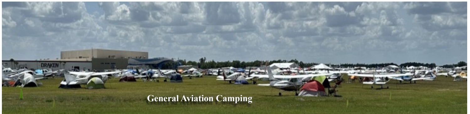
General Aviation Camping